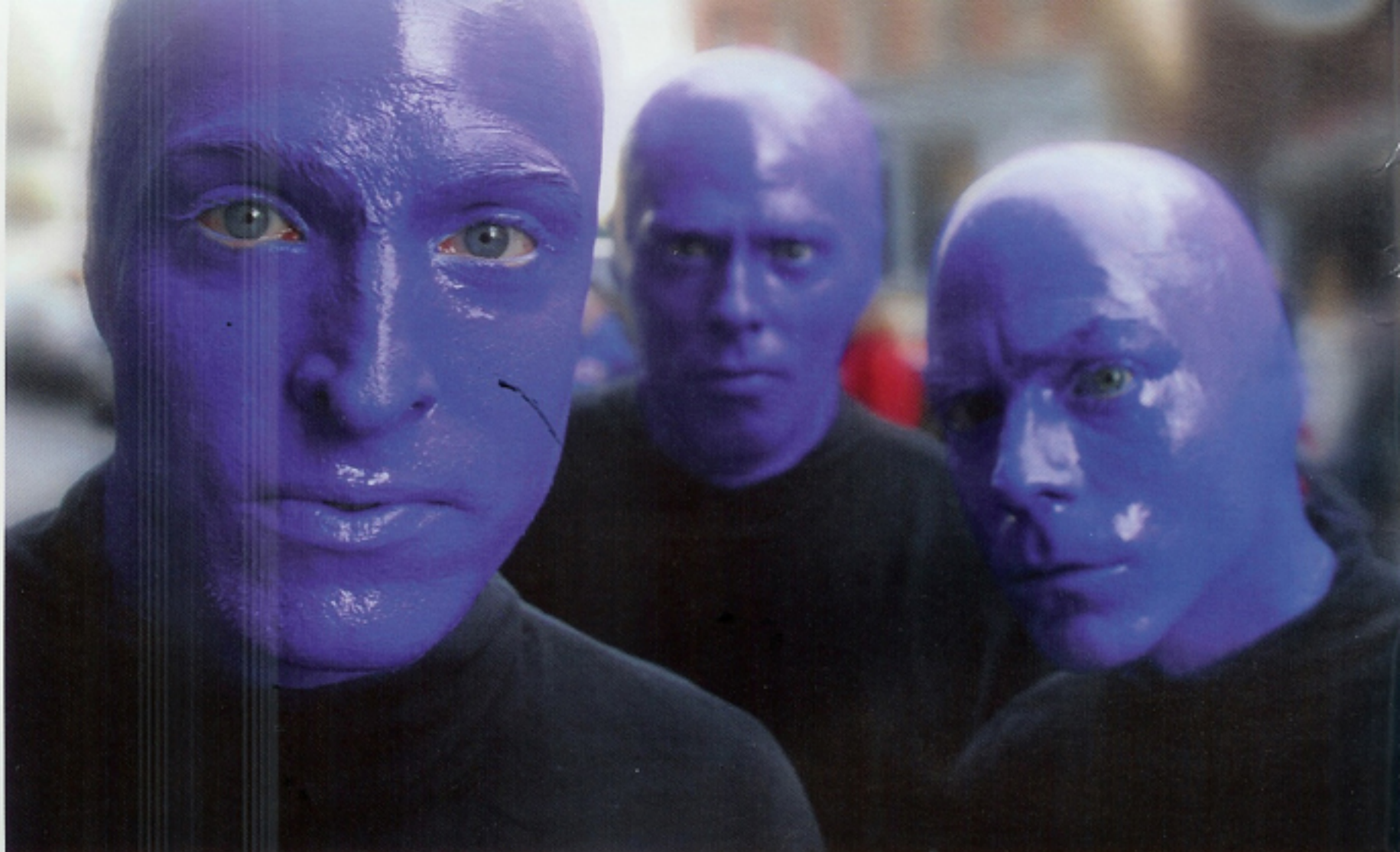
The Blue Man Group.